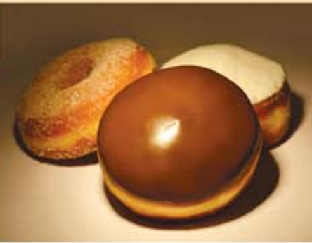
Indulgent Chocolate Donut with Chocolate Vermicelli