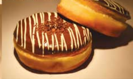
Indulgent Chocolate Donut with Chocolate Vermicelli